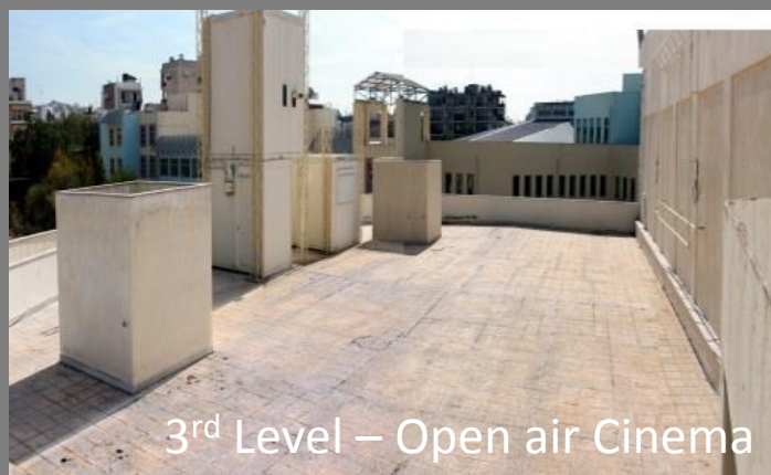
3 rd Level – Open air Cinema