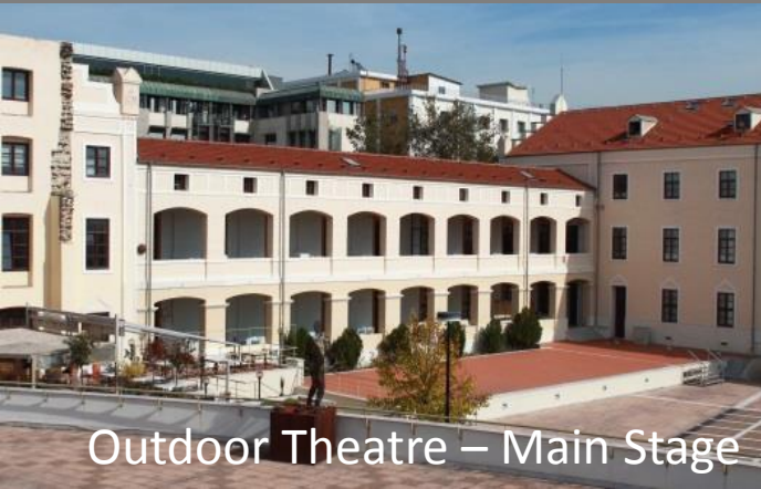
Outdoor Theatre – Main Stage