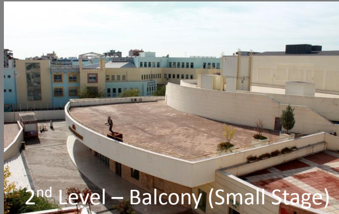
2 nd Level – Balcony (Small Stage)