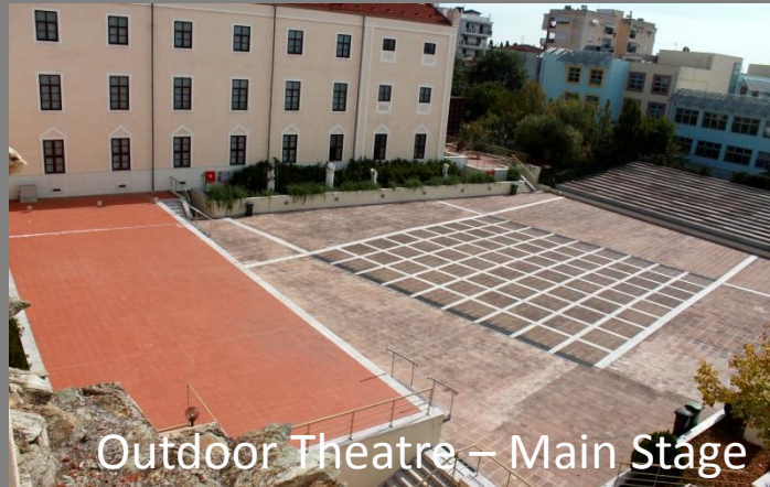
Outdoor Theatre – Main Stage