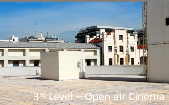
3 rd Level – Open air Cinema